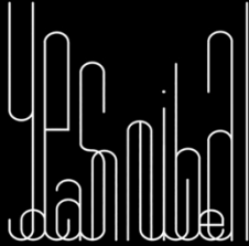
Show Card - Back

OPENING RECEPTION Saturday December 14th 5-7 pm