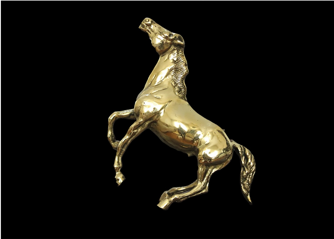
Show Card - Front